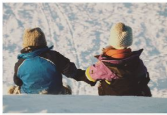
Schools and Early Learning and Childcare