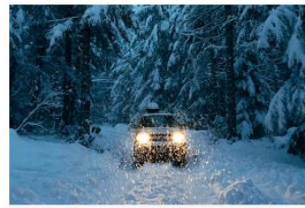
Road Safety and Travelling Abroad