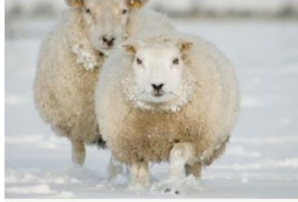
Businesses and Farm Safety