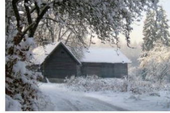
The Home and Community