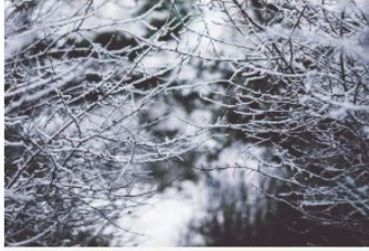
Weather Warnings and Flooding