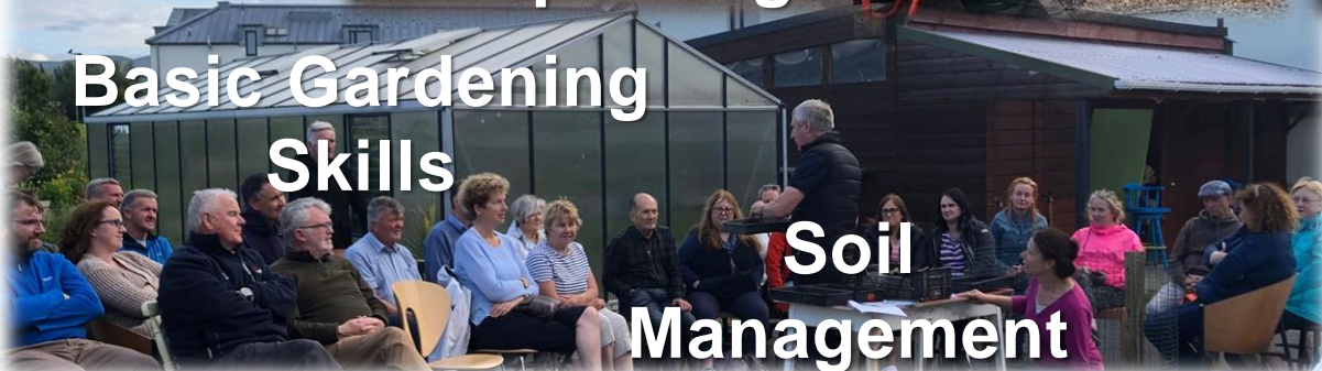
Basic Gardening Skills